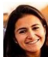
Carla Padilla Events